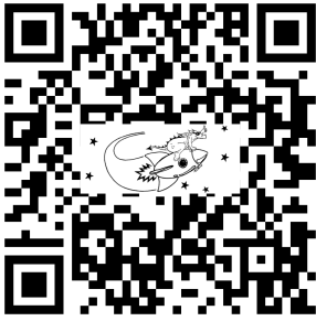
Rocket Mail Page